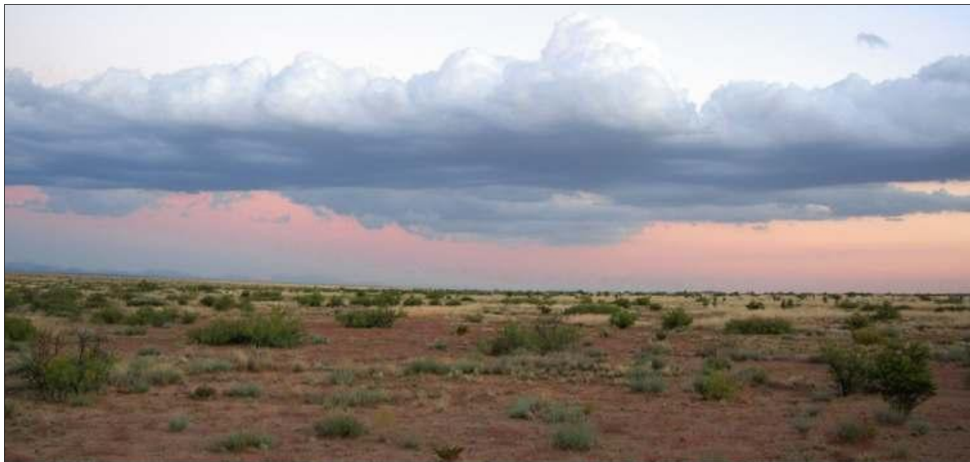
View of the Jornada from near Engle New Mexico