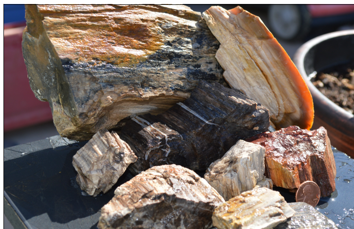
Some of the different types of Petrified Wood that can be found in this area!