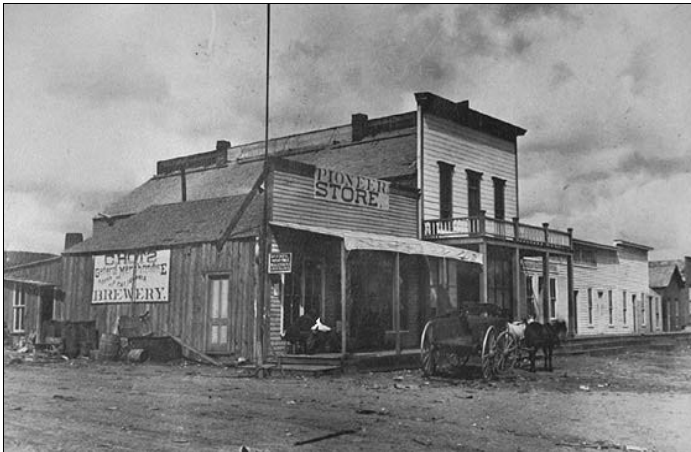
Lake Valley NM 1890's

Hunting area across the road is all along County Road BO05. I have found many specimens right by the "Y" on this map, including fossils, rhodonite, magnetite, psilomelane, as well as agate and jasper.