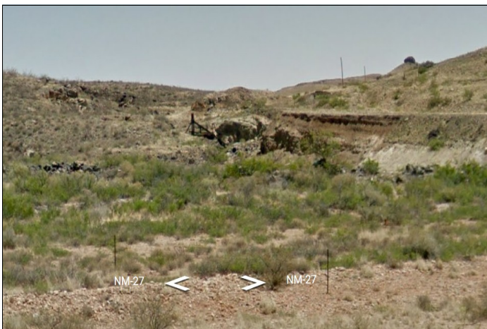
View to right just past Lake Valley Town-Site