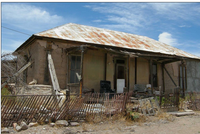
Bella Hotel, Lake Valley NM